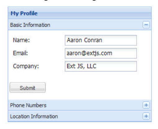
Figure 1. Loading and submitting data

To begin with, we are going to study only the first form in the demo (see Figure 1 ). The data is some kind of basic person info that includes a name, an email and a company. Even if it is not visible, there is an id that uniquely identifies the person, and an additional hidden foo field, just to make things interesting.